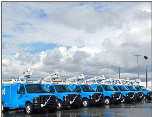
National Fleet Services

Address: 305 N Frisco St. Winters, TX Building Size: 120,000 sq. ft. Shop Sq. Ft.: 100,000 sq. ft.