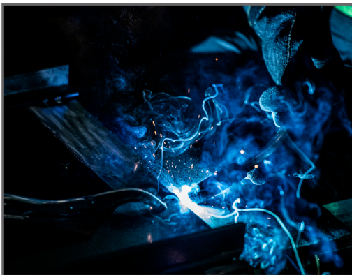
Custom Manufacturing & Fabrication