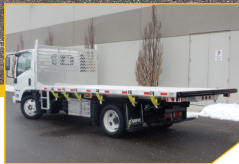
Chassis: Isuzu NRR (Shown: 16' Aluminum Dumping Deck)