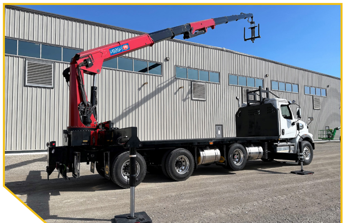
HMF 9 Story Cranes