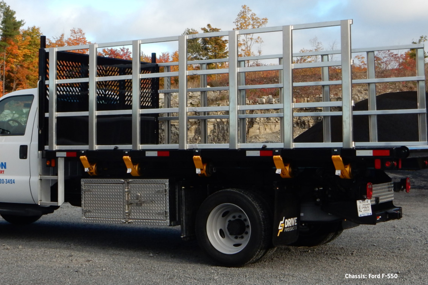
Chassis: Ford F-550