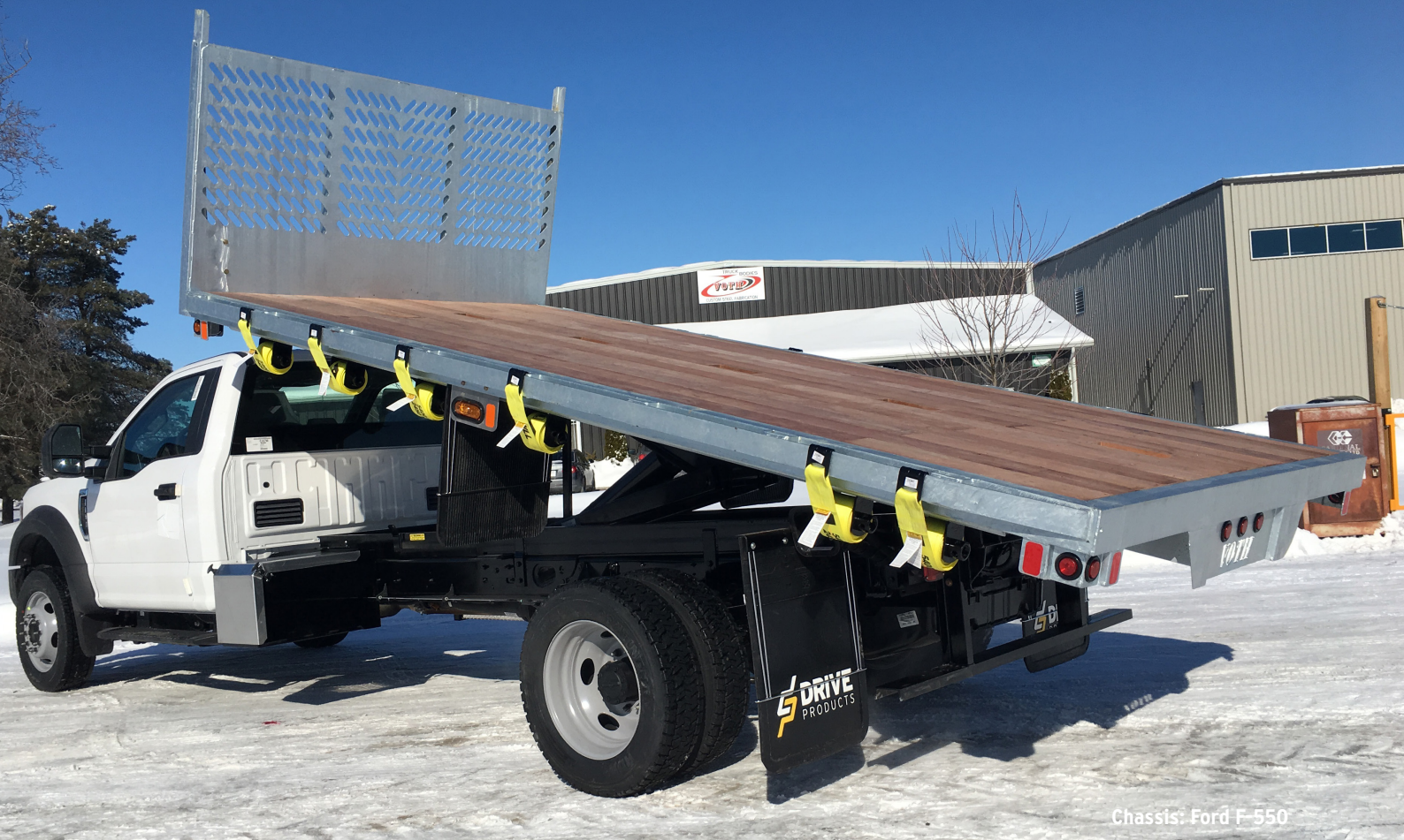
Chassis: Ford F-550