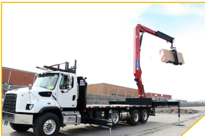
HMF 6 Story Cranes

Increase your productivity with the highest lifting hydraulic loader from HMF. The 42684 loader crane can easily lift supplies up to nine stories. Purposeful technology make our loaders lift more, reach farther, and last longer - so you can stick to your schedule.